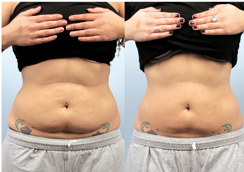
CoolSculpting - The before and after photos above illustrate results from a CoolSculpting Procedure for targeted fat reduction